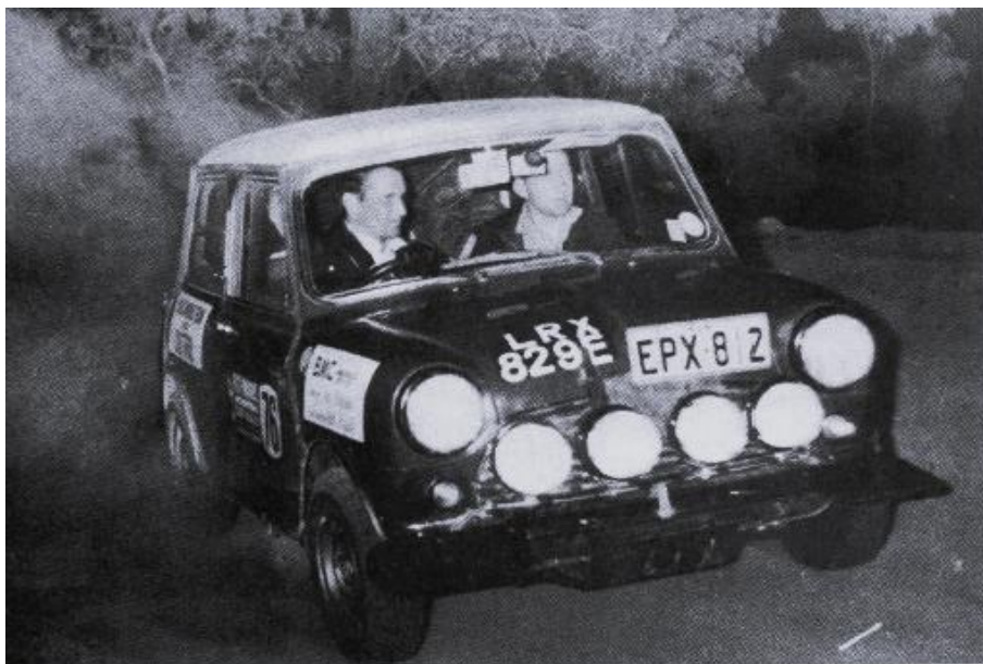
LED in early stages, amazing rivals by his speeds in rough country, till outed by broken gearbox: Timo Makinen in works Mini-Cooper S with Bob Forsyth.

launched into a special stage—14 miles of narrow, twisting road down a mountainside to Goodman's Ford. You'd think twice about walking down some parts of the road, but contestants were given 20 minutes, with a penalty of one point per 15sec. late.