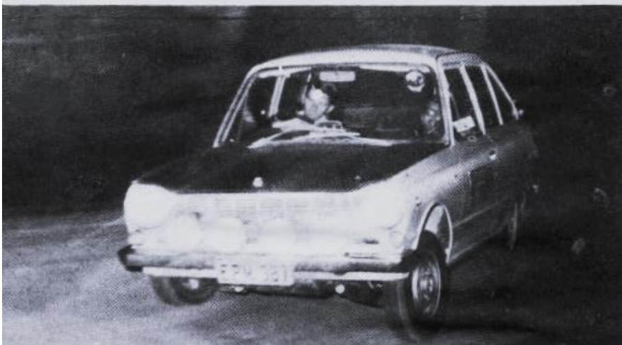
DRIFTING round a bend with opposite lock on to check a tail breakaway—Colin Bond in fourth-placed Mitsubishi Colt. Open-mouthed navigator is Brian Hope.

The forests became a nightmare of bogged cars, long queues of stranded vehicles, and mud holes that grew deeper with the passage of every